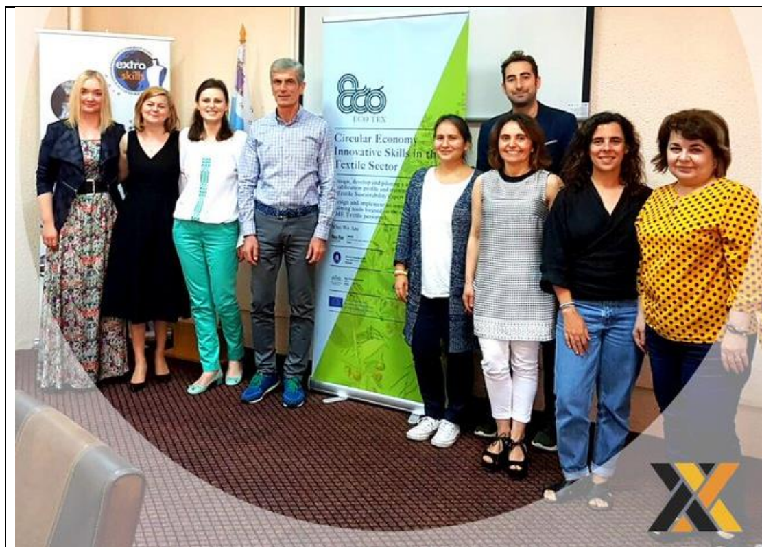
Technical Meeting, Iasi, 2019