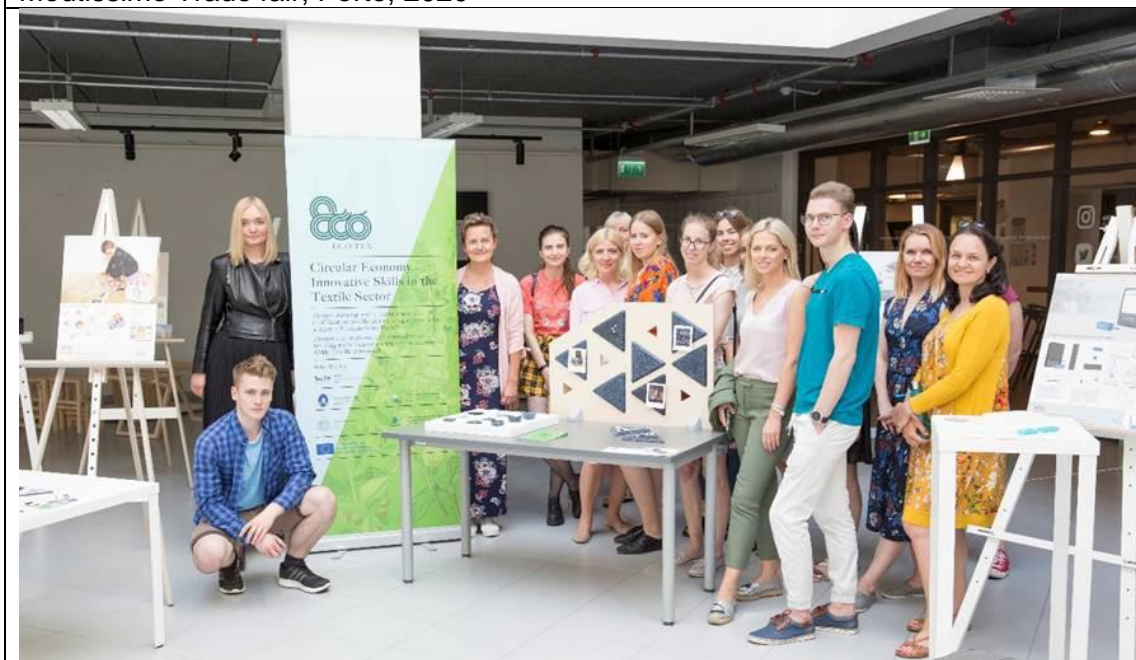
DizainaKods, Annual Exhibition of the Institute of Design technologies RTU, 2019