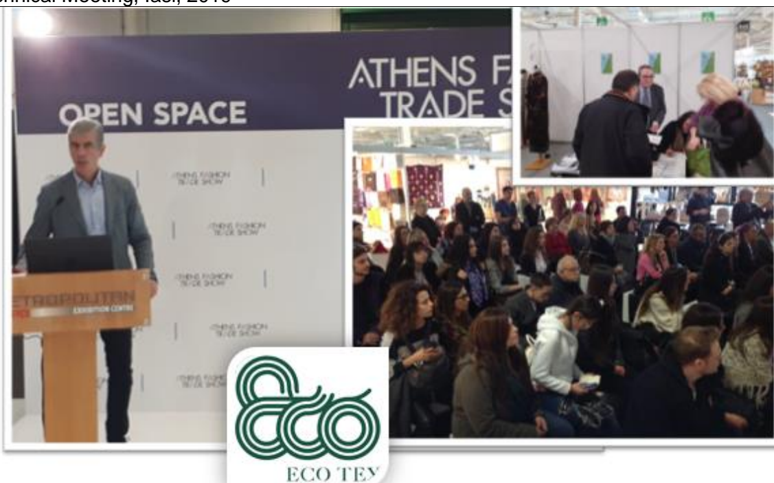
Athen Fashion Trade show, 2020