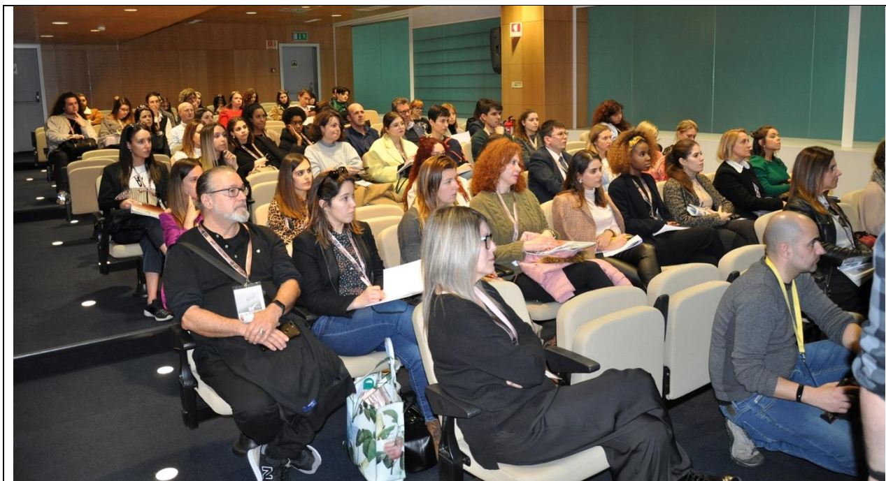
Modtissimo Trade fair, Porto, 2020