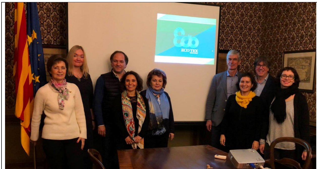
Kick of Meeting, Barcelona, 2018